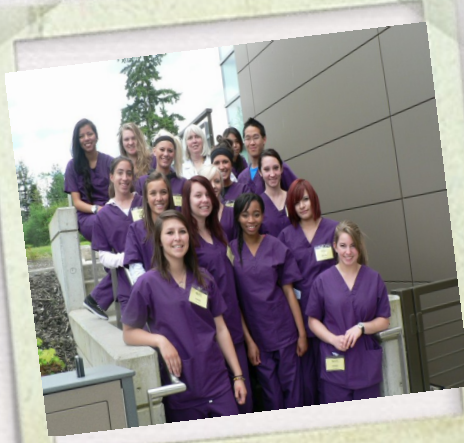
Certified Nursing Assistant