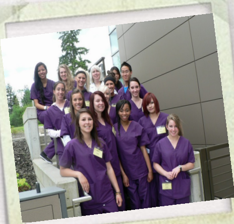
Certified Nursing Assistant